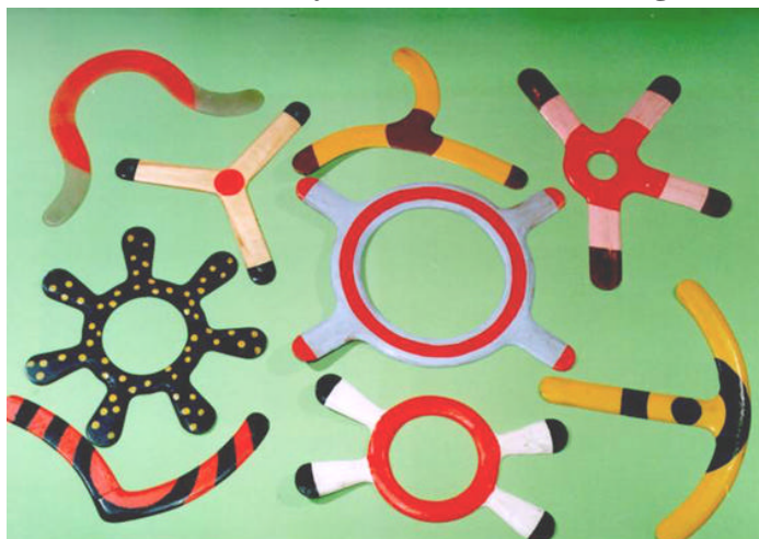
Miscellaneous Boomerangs by Aivars Brengulis

Aivars makes a large variety of two bladed and multi-bladed boomerangs out of plywood. He also makes boomerangs out of Latvian natural elbow materials. These boomerangs sell for only $7 (USD). This includes shipping to anywhere in the world! These boomerangs are a real bargain.