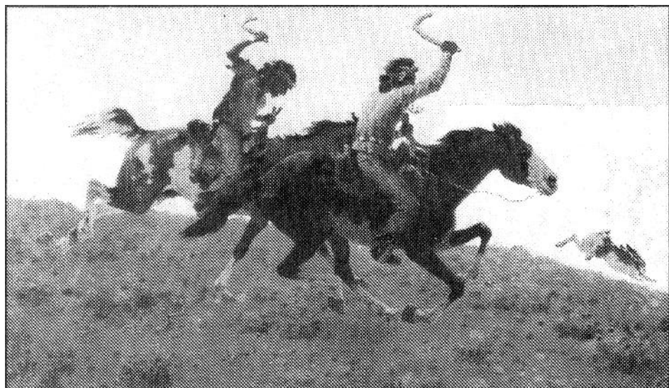
W. R. Leigh (1866-1955) Rabbit Hunt, oil, 16 x 26 inches