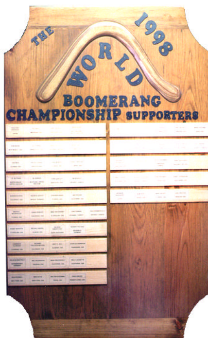
World Cup Supporters Plaque

A sum of $1 will be donated to the 1998 World Cup with the purchase of each catalog. John is constructing a plaque with the names of everyone who has purchased a catalog. This plaque, shown below, will be raffled at the 1998 World Cup as a fund raiser. There is room for at least 50 more names. If you want to purchase a Cryderman catalog and add your name to the plaque, you can send $5 to the following address: