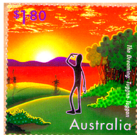
The Dreaming - Aussie Stamp

Günter Wandtke Warrah Village 20 Harris Rd. Dural NSW 2158 Australia