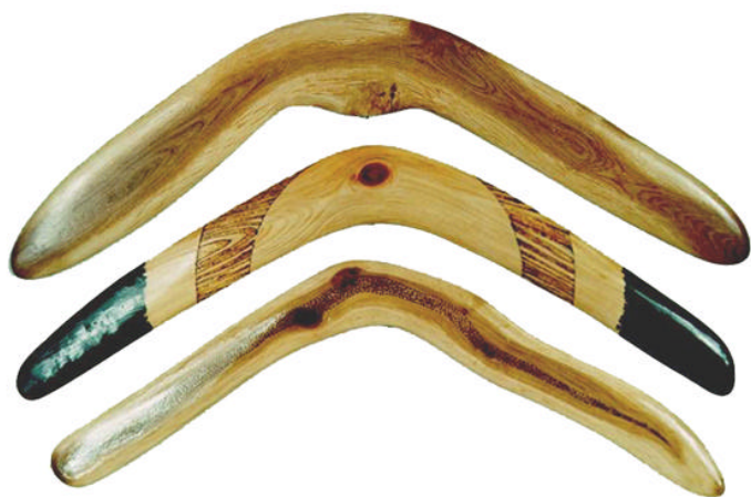
Natural Elbows by Latvia's Aivars Brengulis