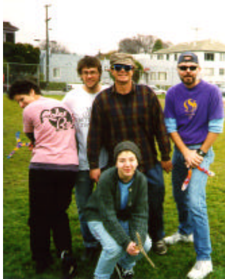
Team Roller Blade

tween each other for maximum points), Super Catch, and Round Rang Relay were the games that rang in the new year! Most of the highlights came from the novice throwers who put out tons of effort learning how to throw accurately and catch with style. After all the fun boomerang playing was done, everyone received hand-painted plaque trophies that were made the day before at the trophy making party! All the players went home happy from good weather, great friends and rad effort.