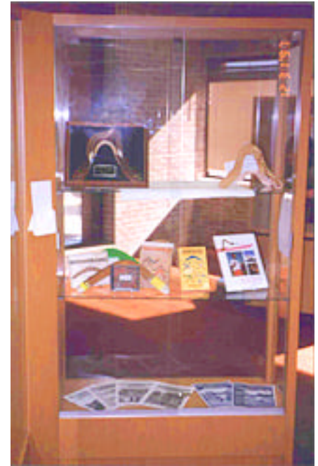
Steigman Library Display

Bill Tumath sold a large quantity of beautiful Herb Smith boomerangs in early January to the surprise of enthusiastic boomerang collectors. The prices were similar to those generated in the 1996 & 1997 boomerang auctions. Surprisingly, the quantity of boomerangs sold did not suppress the prices that collectors were willing to pay (wood: $65 - $180 and Paxolin: $175 - $300). It appears that collectable boomerangs have become a legitimate invest-