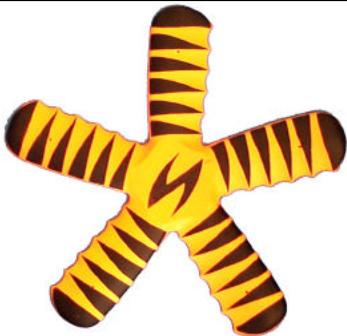
New Commercial Five-Bladed TEK Boomerang