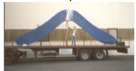
World's Largest Boomerang